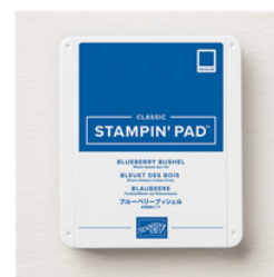
Blueberry Bushel Classic Stampin' Pad - 147138