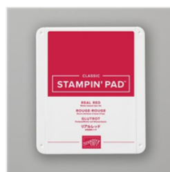
Real Red Classic Stampin' Pad - 147084