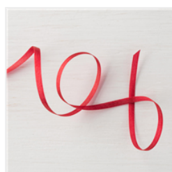
Real Red 1/8" (3.2 Mm) Solid Ribbon - 144631