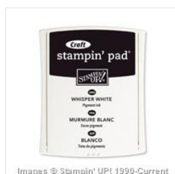
Whisper White Craft Stampin' Pad - 101731