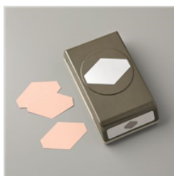
Tailored Tag Punch - 145667

angelstamps@hotmail.com angelstamps1.blogspot.com