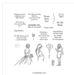
Wonderful Moments Photopolymer Stamp Set - 147529