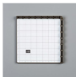
Stamparatus - 146276