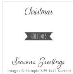
Watercolor Winter Too Photopolymer Stamp Set - 136819