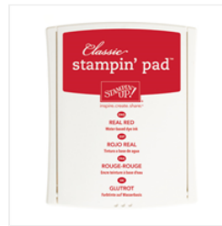
Real Red Classic Stampin' Pad - 126949