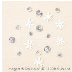
Frosted Sequins - 135835