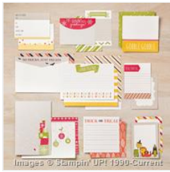
Seasonal Snapshot Project Life Card Collection - 135830