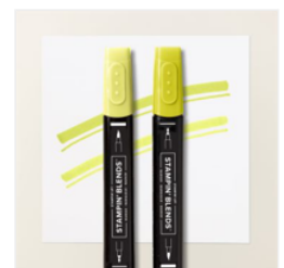
Lemon Lime Twist Stampin' Blends Combo Pack - 161682