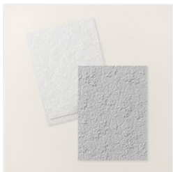
Stone & Vine 3D Embossing Folder - 166990