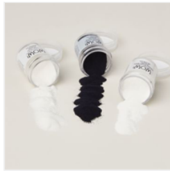
Basics Wow! Embossing Powder - 165679