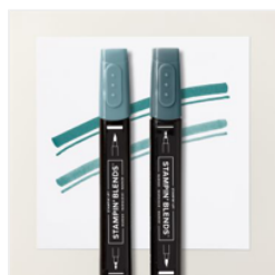
Pretty Peacock Stampin' Blends Combo Pack - 161676