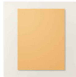
Golden Glow 8- 1/2" X 11" Cardstock - 167685