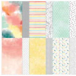
Beautiful Ordinary Life 12" X 12" (30.5 X 30.5 Cm) Designer Series Paper - 167553