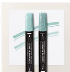
Lost Lagoon Stampin' Blends Combo Pack - 161680