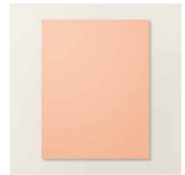
Crisp Cantaloupe 8-1/2" X 11" Cardstock - 167693