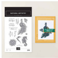
Natural Artistry Photopolymer Stamp Set (English) - 167959