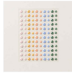
2026-2028 In Color™ Dots - 167546