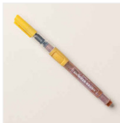
Golden Glow Shimmer Brush - 167662