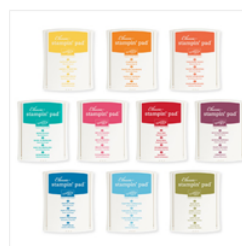
Brights Classic Stampin' Pads - 131182