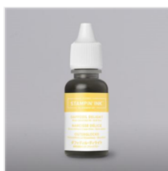
Daffodil Delight Classic Stampin' Ink Refill - 119672