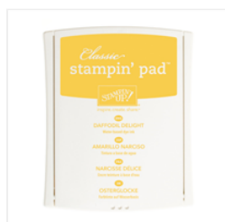
Daffodil Delight Classic Stampin' Pad - 126944