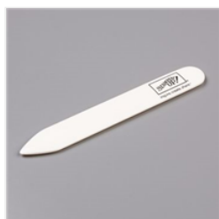
Bone Folder - 102300

kristafrattin@yahoo.com www.stampindolce.com