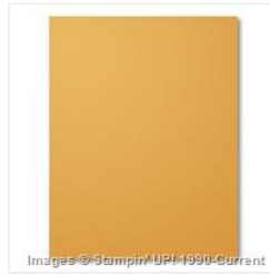
Delightful Dijon 8-1/2" X 11" Cardstock - 138338