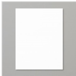
Whisper White 8-1/2" X 11" Cardstock - 100730