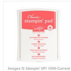
Watermelon Wonder Classic Stampin' Pad - 138323