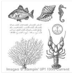
By The Tide Clear-Mount Stamp Set - 129120

astampingteddy@gmail.com http://stampingincolumbusga.blogspot.com/