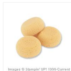
Stamping Sponges - 101610