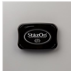
Jet Black Stazon Ink Pad - 101406