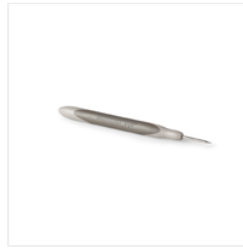
Paper-Piercing Tool - 126189