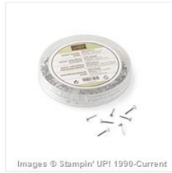
1/8" Silver Mini Brads - 122941