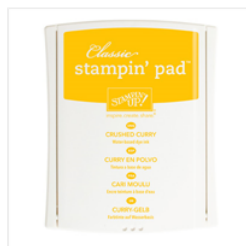
Crushed Curry Classic Stampin' Pad - 131173