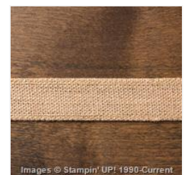
1-1/4" Burlap Ribbon - 132140