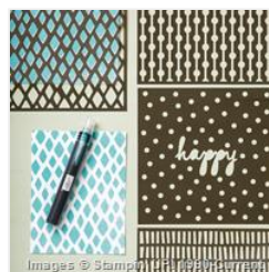
Happy Patterns Decorative Masks - 138313