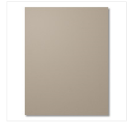
Tip Top Taupe 8-1/2" X 11" Cardstock - 138336