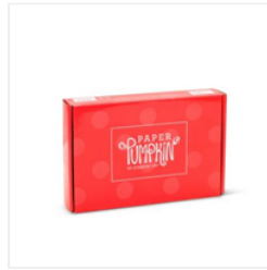
Prepaid Paper Pumpkin Subscription 1-Month - 137858