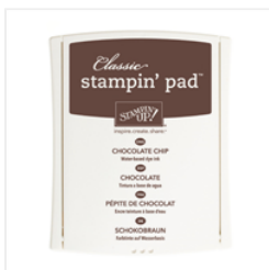
Chocolate Chip Classic Stampin' Pad - 126979