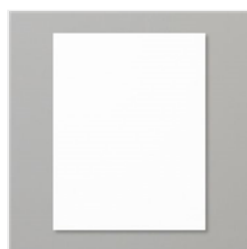
Whisper White 8-1/2\" data-bbox="252 233 395 306"/>