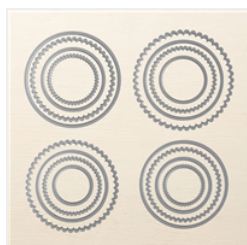
Layering Circles Dies - 141705