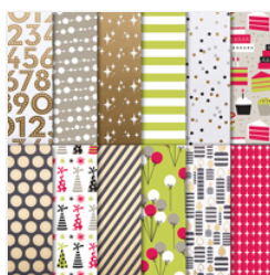
Broadway Bound Speciality Designer Series Paper - 146277