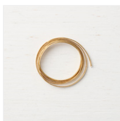
Gold 1/8\" data-bbox="69 680 224 716"/>