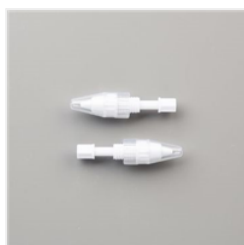
Take Your Pick Putty Refill - 150006