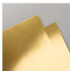
Gold Foil Sheets - 132622