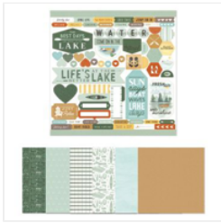
Lake Life Paper Packet & Sticker Sheet - 166335

clarke.karen.a@gmail.com https://karenclarke.stampinup.net/