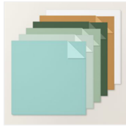
Lake Life Coordinating Two-Tone Cardstock - 166337