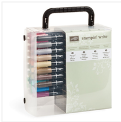
Many Marvelous Markers - 131264