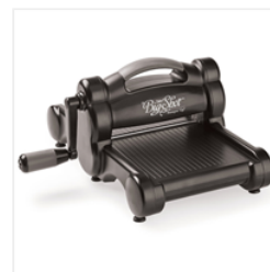
Big Shot - 143263