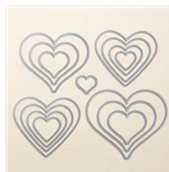
Sweet & Sassy Framelits Dies - 141707