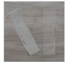
2" X 8" (5.1 X 20.3 Cm) Cellophane Bags - 141703