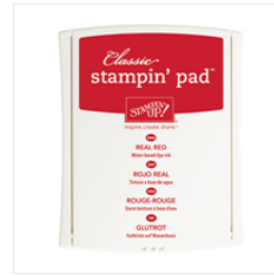
Real Red Classic Stampin' Pad - 126949