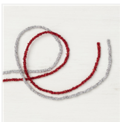
Mini Tinsel Trim Combo Pack - 144636