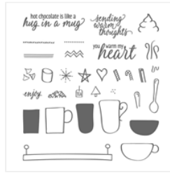
Hug In A Mug Photopolymer Stamp Set* - 144933