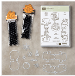
Seasonal Chums Clear-Mount Bundle* - 146077