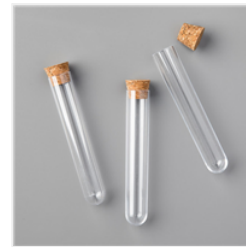
Treat Tubes - 144612