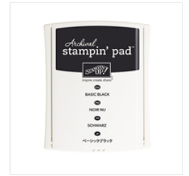
Basic Black Archival Stampin' Pad - 140931