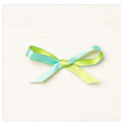
Coastal Cabana/Granny Apple Green 3/8" (1 Cm) Reversible Ribbon - 148572