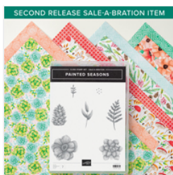
Painted Seasons Bundle - 150349