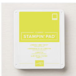
Lemon Lime Twist Classic Stampin' Pad - 147145