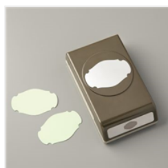
Story Label Punch - 150076