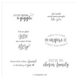
Part Of My Story Cling Stamp Set - 149719