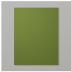
Mossy Meadow 8-1/2\" X 11\" Cardstock - 133676

https://itsastampthing-vicki.blogspot.com/