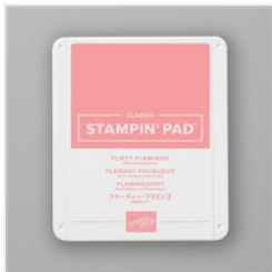
Flirty Flamingo Classic Stampin' Pad - 147052