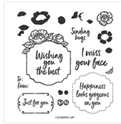
Tags In Bloom Photopolymer Stamp Set (English) - 152292