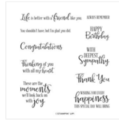
Peaceful Moments Cling Stamp Set (En) - 151595