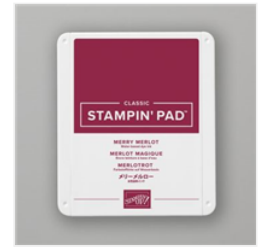
Merry Merlot Classic Stampin' Pad - 147112