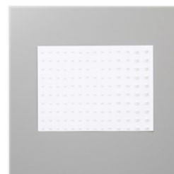
Pearl Basic Jewels - 144219