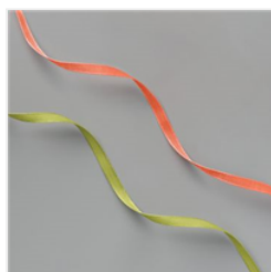
Ornate Garden Ribbon Combo Pack - 152479