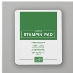
Garden Green Classic Stampin' Pad - 147089