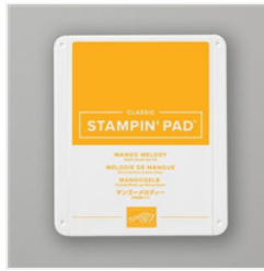
Mango Melody Classic Stampin' Pad - 147093