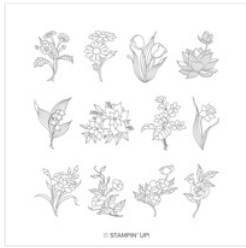
In Every Season Clear-Mount Stamp Set - 146709

stampinheeb@yaho.com www.stampinannies.com