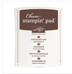
Chocolate Chip Classic Stampin' Pad - 126979