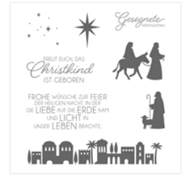
Heilige Nacht Clear-Mount Stamp Set (German) - 145036