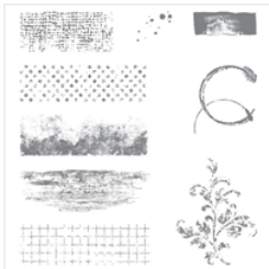
Timeless Textures Clear-Mount Stamp Set - 140517