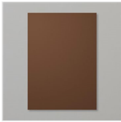
Farbkarton A4 Espresso - 121686

Doris Pichler +43 664 630 7603 office@dorispichler.at http://www.dorispichler.at/blog/