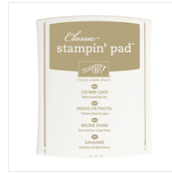
Crumb Cake Classic Stampin' Pad - 126975