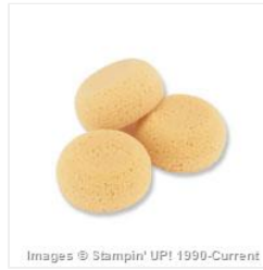
Stamping Sponges - 101610