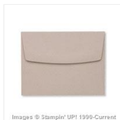
Crumb Cake Medium Envelopes - 107297