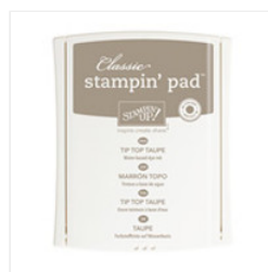
Tip Top Taupe Classic Stampin' Pad - 138325