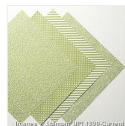
Subtles Designer Series Paper Stack - 138437