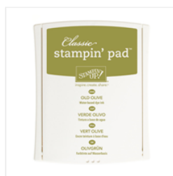
Old Olive Classic Stampin' Pad - 126953