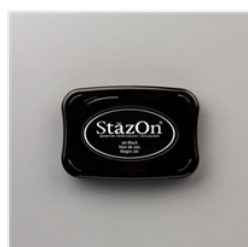
Jet Black Stazon Pad - 101406