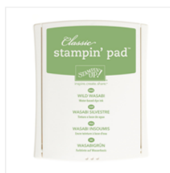
Wild Wasabi Classic Stampin' Pad - 126959