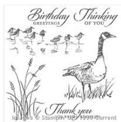
Wetlands Clear-Mount Stamp Set - 126697

http://www.stampinup.net/esuite/home/karenstallman/