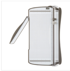
Stampin' Trimmer - 126889

http://www.stampinup.net/esuite/home/karenstallman/