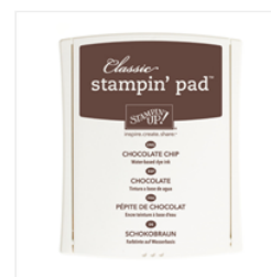
Chocolate Chip Classic Stampin' Pad - 126979