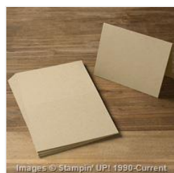
Crumb Cake Cut & Ready Card Bases - 135806