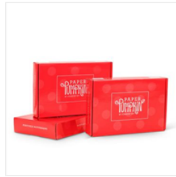
Prepaid Paper Pumpkin Subscription 3- Month - 137859