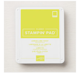
Lemon Lime Twist Classic Stampin' Pad - 147145