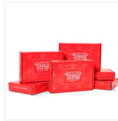
Prepaid Paper Pumpkin Subscription 6- Month - 137860