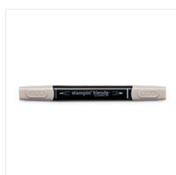
Crumb Cake Light Stampin' Blends Marker - 144582