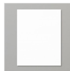
Shimmery White 8-1/2" X 11" Cardstock - 101910