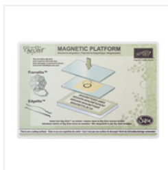
Magnetic Platform - 130658