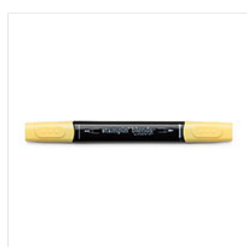
Daffodil Delight Light Stampin' Blends Marker - 144586