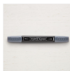
Basic Black Dark Stampin' Blends - 147941