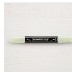
Soft Sea Foam Dark Stampin' Blends Marker - 148058