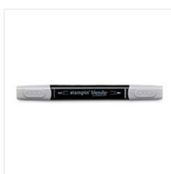
Smoky Slate Light Stampin' Blends Marker - 145054