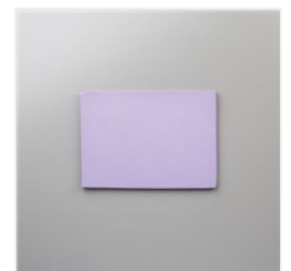
Simply Shammy - 147042