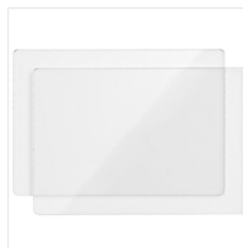
Standard Cutting Pads - 113475