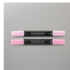
Flirty Flamingo Stampin' Blends Markers Combo Pack - 147278