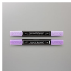
Highland Heather Stampin' Blends Markers Combo Pack - 147276