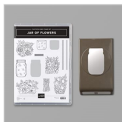
Jar Of Flowers Bundle (En) - 154064