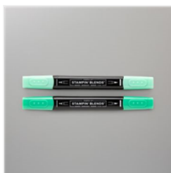
Shaded Spruce Stampin' Blends Combo Pack - 154903