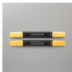
Daffodil Delight Stampin' Blends Markers Combo Pack - 144603