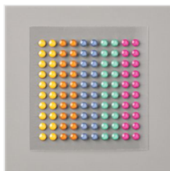
2020-2022 In Color Enamel Dots - 152480