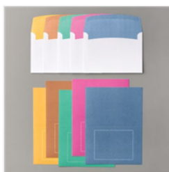
Flowers For Every Season Memories & More Cards & Envelopes - 153101