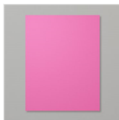
Magenta Madness 8-1/2" X 11" Cardstock - 153080