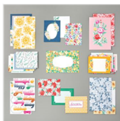
Flowers For Every Season Memories & More Card Pack - 153058