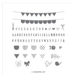
Pick A Pennant Photopolymer Stamp Set - 146499