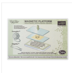
Magnetic Platform - 130658