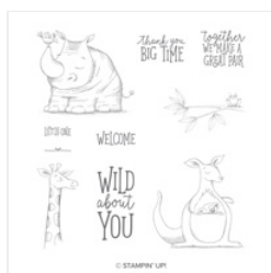
Animal Outing Clear-Mount Stamp Set - 146600