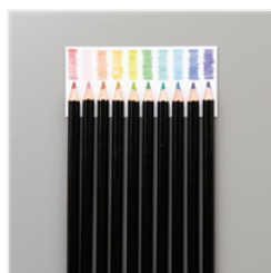
Watercolor Pencils Assortment 2 - 149014