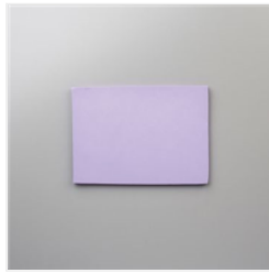
Simply Shammy - 147042