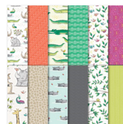
Animal Expedition Designer Series Paper - 146902