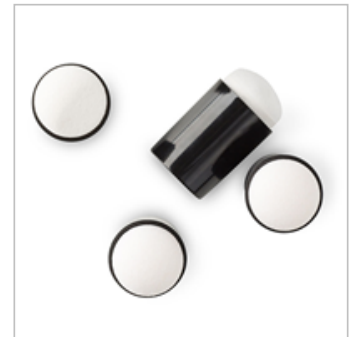
Sponge Daubers 133773 $5.00