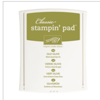
Old Olive Classic Stampin' Pad