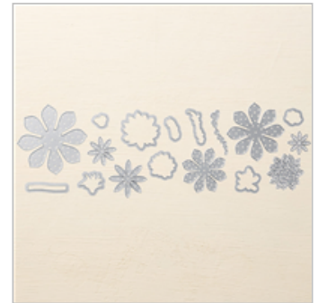
Succulent Framelits Dies