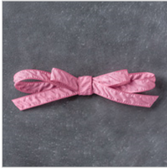
Sweet Sugarplum 3/8" (1 Cm) Ruched Ribbon