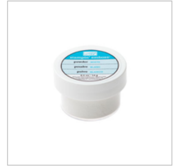
White Stampin' Emboss Powder