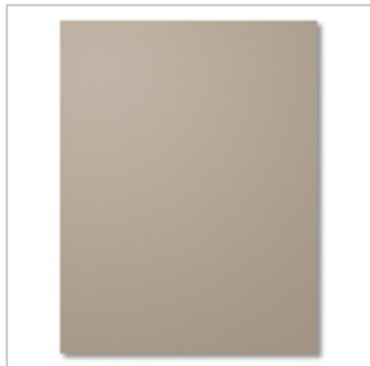
Tip Top Taupe 8-1/2" X 11" Cardstock