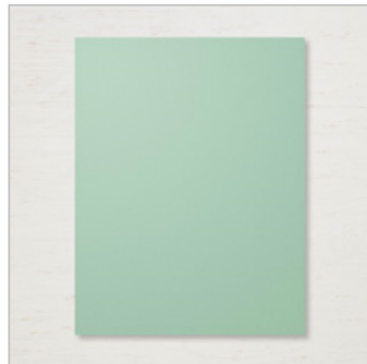
Mint Macaron 8-1/2" X 11" Cardstock