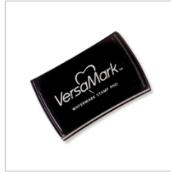
Versamark Pad 102283 $8.50