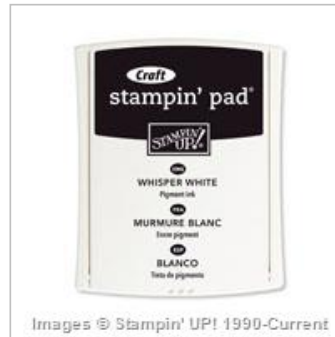
Whisper White Craft Stampin' Pad