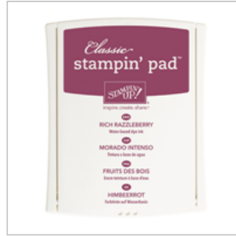
Rich Razzleberry Classic Stampin' Pad