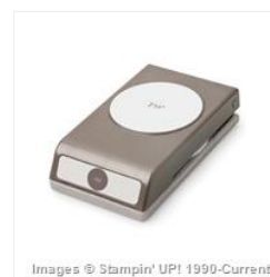
2-1/2" Circle Punch - 120906