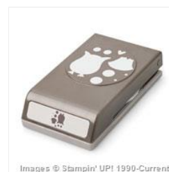
Owl Builder Punch - 118074