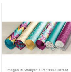
Bohemian Designer Series Paper - 138446