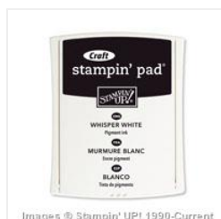
Whisper White Craft Stampin' Pad - 101731