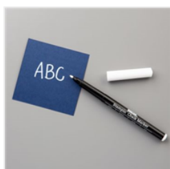
White Stampin' Chalk Marker - 132133