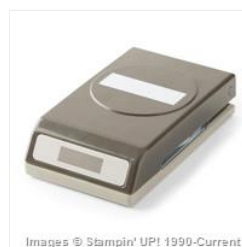
Washi Label Punch - 138296