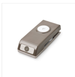
1" (2.5 Cm) Circle Punch - 119868