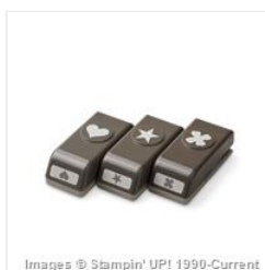
Itty Bitty Accents Punch Pack - 133787