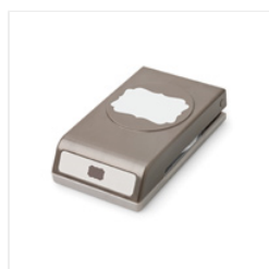
Decorative Label Punch - 120907