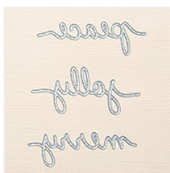
Christmas Greetings Thinlits Dies - 139659