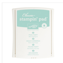
Pool Party Classic Stampin' Pad - 126982