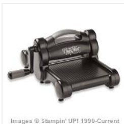
Big Shot - 113439