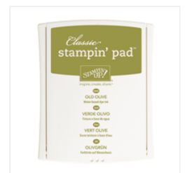
Old Olive Classic Stampin' Pad - 126953