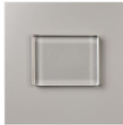
Clear Block E - 118484