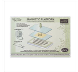
Magnetic Platform - 130658