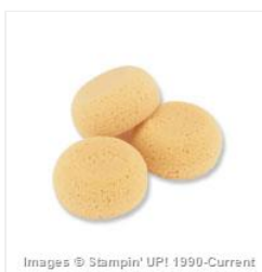
Stamping Sponges - 101610