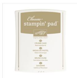
Crumb Cake Classic Stampin' Pad - 126975

France "Frenchie" Martin 832-602-3290 frenchiestamps@hotmail.com http://www.frenchiestamps.com