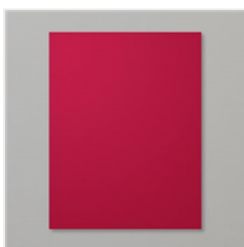
Cherry Cobbler 8-1/2" X 11" Cardstock - 119685