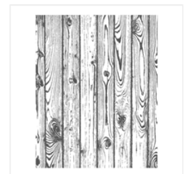
Hardwood Wood-Mount Stamp - 133032