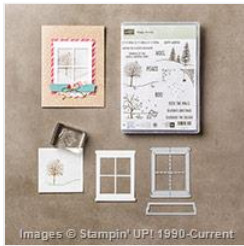
Happy Scenes Photopolymer Bundle - 140853