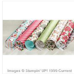
Home For Christmas Designer Series Paper - 139592