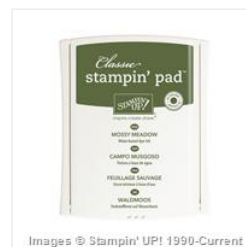
Mossy Meadow Classic Stampin' Pad - 133645