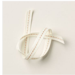
Pecan Pie 3/8" (1 Cm) Center Stripe Ribbon - 162744