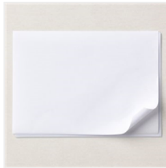
Stampin' Up! Masking Paper - 155480