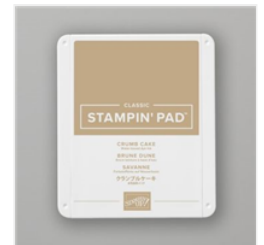
Crumb Cake Classic Stampin' Pad - 147116