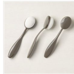
Blending Brushes - 153611