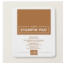
Pecan Pie Classic Stampin' Pad - 161665