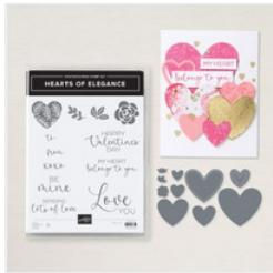
Hearts Of Elegance Bundle (English) - 164916

Barbara@GreenMoonStampStudio.com GreenMoonStampStudio.com