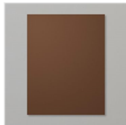
Early Espresso 8-1/2" X 11" Cardstock - 119686