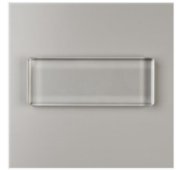
Clear Block I - 118488