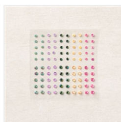
2021-2023 In Color Jewels - 155571