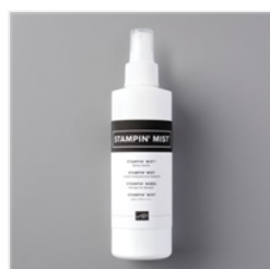
Stampin' Mist - 153648