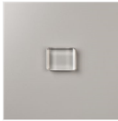
Clear Block B - 117147