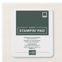
Evening Evergreen Classic Stampin' Pad - 155576