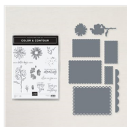
Color & Contour Bundle (English) - 158356