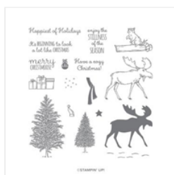
Merry Moose Photopolymer Stamp Set - 150494