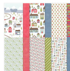
Trimming The Town Designer Series Paper - 153491