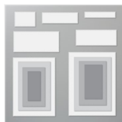
Rectangle Stitched Dies - 151820