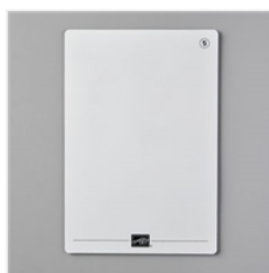
Magnetic Cutting Plate - 149656