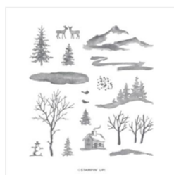
Snow Front Photopolymer Stamp Set - 150483