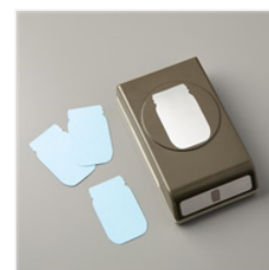
Jar Punch - 152703