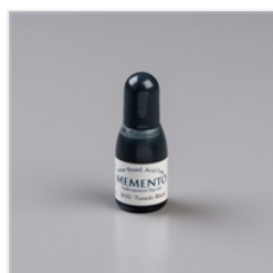
Tuxedo Black Memento Ink Refill - 133456