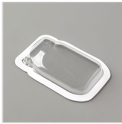
Mason Jar Shaker Domes - 153100