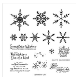
Snowflake Wishes Photopolymer Stamp Set (English) - 158267