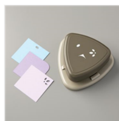
Detailed Trio Punch - 146320