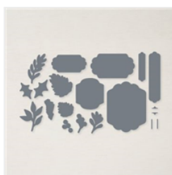
Seasonal Labels Dies - 156299