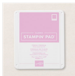
Fresh Freesia Classic Stampin' Pad - 155611