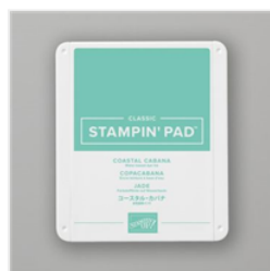
Coastal Cabana Classic Stampin' Pad - 147097