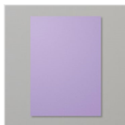
Highland Heather A4 Cardstock - 147010