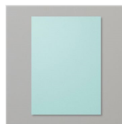
Pool Party A4 Cardstock - 124391