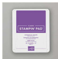
Gorgeous Grape Classic Stampin' Pad - 147099