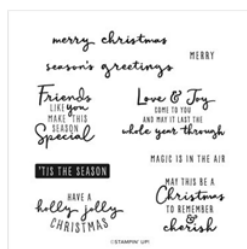
Christmas To Remember Cling Stamp Set (English) - 156300