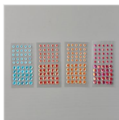
Artistry Blooms Adhesive-Backed Sequins - 152477