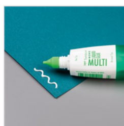
Multipurpose Liquid Glue - 154974