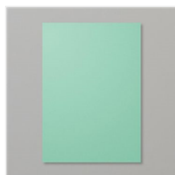
Coastal Cabana A4 Cardstock - 131302