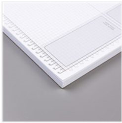
Grid Paper - 130148