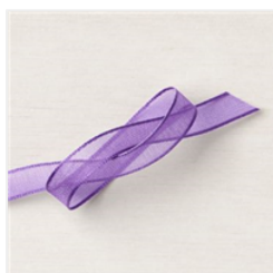
Gorgeous Grape 3/8" (1 Cm) Sheer Ribbon - 154572