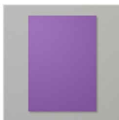
Gorgeous Grape A4 Cardstock - 147011