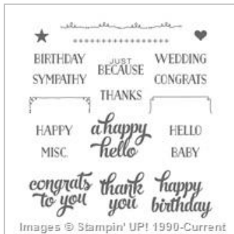
Tin Of Cards Photopolymer Stamp