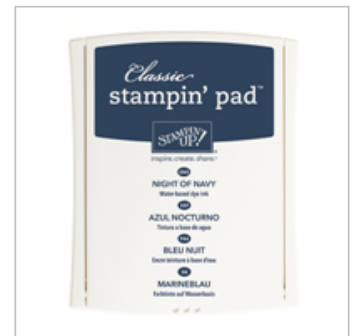
Night Of Navy Classic Stampin' Pad