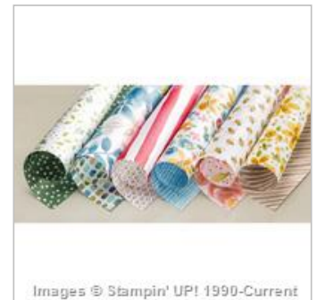
English Garden Designer Series