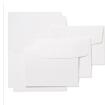
Whisper White Note Cards & Envelopes