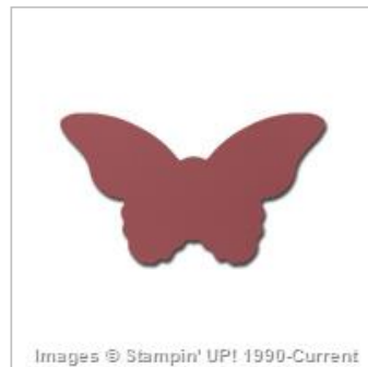
Bitty Butterfly Punch