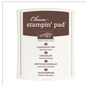
Chocolate Chip Classic Stampin' Pad