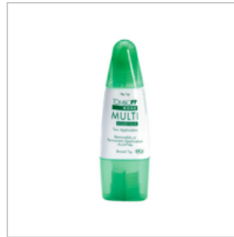
Multipurpose Liquid Glue