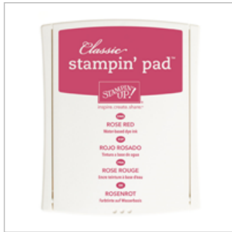
Rose Red Classic Stampin' Pad