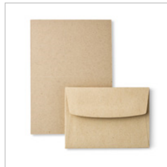
Crumb Cake Note Cards & Envelopes