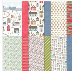
Trimming The Town Designer Series Paper - 153491