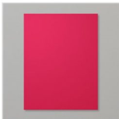
Real Red 8-1/2" X 11" Cardstock - 102482