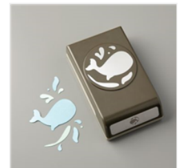
Whale Punch - 152699