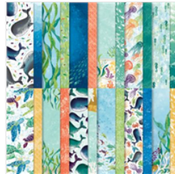
Whale Of A Time 6" X 6" (15.2 X 15.2 Cm) Designer Series Paper - 152460