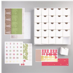
Christmas Countdown Project Kit - 150703