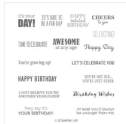
Itty Bitty Birthdays Cling Stamp Set - 148618