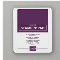
Blackberry Bliss Classic Stampin' Pad - 147092