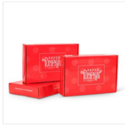
Prepaid Paper Pumpkin Subscription 3- Month - 137859