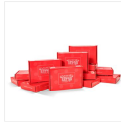
Prepaid Paper Pumpkin Subscription 12- Month - 137861