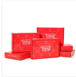
Prepaid Paper Pumpkin Subscription 6- Month - 137860