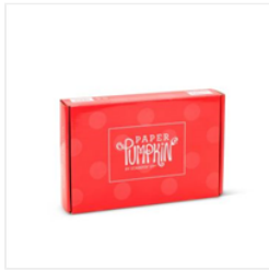
Prepaid Paper Pumpkin Subscription 1- Month - 137858