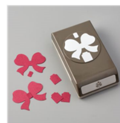
Gift Bow Builder Punch - 153606