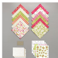
Most Wonderful Time Product Medley Refill - 151270