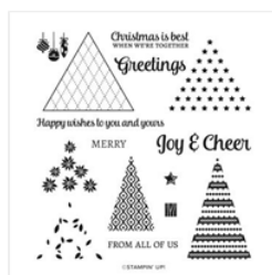
Tree Angle Photopolymer Stamp Set - 153442