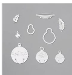
Sounds Of The Season Dies - 154043