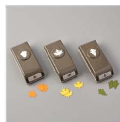
Autumn Punch Pack - 153609