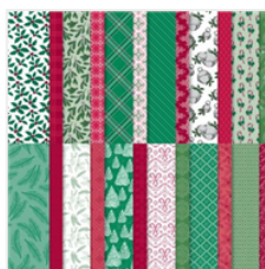
'Tis The Season 6" X 6" (15.2 X 15.2 Cm) Designer Series Paper - 153489