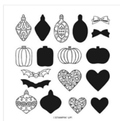
Turnovers Photopolymer Stamp Set - 154873