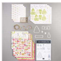
Most Wonderful Time Product Medley (English) - 150705