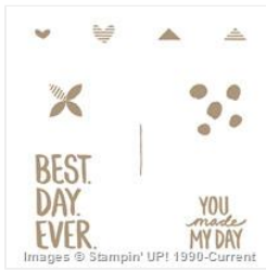
Best Day Ever Wood Stamp Set - 139091