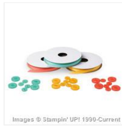
Best Year Ever Accessory Pack - 138634