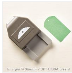
Ornate Tag Topper Punch - 137416