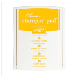
Crushed Curry Classic Stampin' Pad - 131173