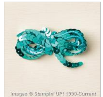
Bermuda Bay Sequin Trim