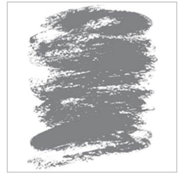
Watercolor Wash Wood-Mount Background Stamp