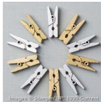
Mini Metallic Clothespins