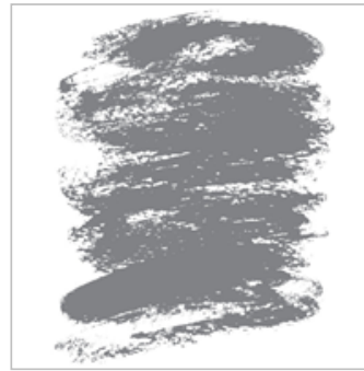
Watercolor Wash Clear-Mount Background Stamp