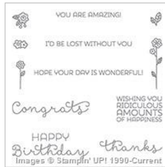
Cottage Greetings Wood-Mount Stamp