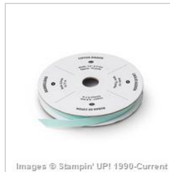
Pool Party 1/4" Cotton Ribbon