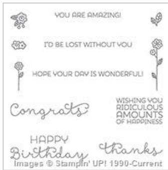
Cottage Greetings Clear-Mount Stamp