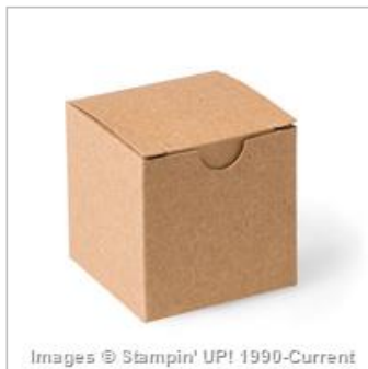
Tiny Treat Boxes