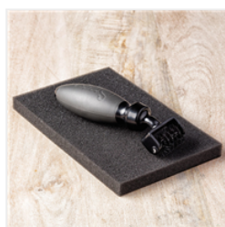
Big Shot Die Brush - New Configuration - 144262