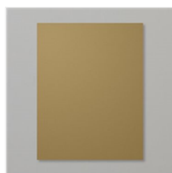
Soft Suede 8-1/2\" X 11\" Cardstock - 115318