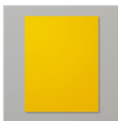
Crushed Curry 8-1/2\" X 11\" Cardstock - 131199