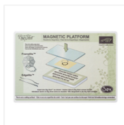
Magnetic Platform - 130658