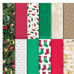
All Is Bright 12\" X 12\" (30.5 X 30.5 Cm) Designer Series Paper - 147892