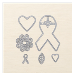
Support Ribbon Dies - 143749