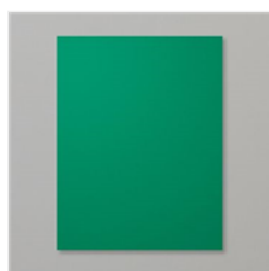
Shaded Spruce 8-1/2\" X 11\" Cardstock - 146981