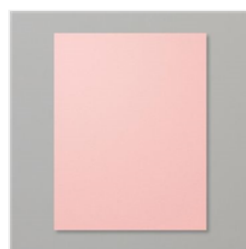
Blushing Bride 8-1/2\" X 11\" Cardstock - 131198