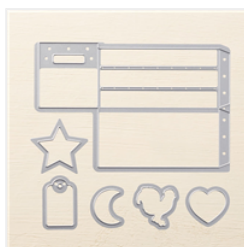
Wood Crate Framelits Dies - 143730