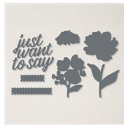
Floral Gallery Dies - 154316