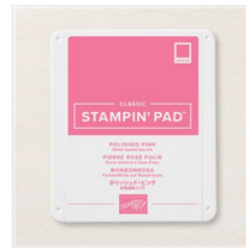
Polished Pink Classic Stampin' Pad - 155712