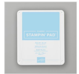
Balmy Blue Classic Stampin' Pad - 147105