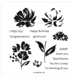
Art Gallery Photopolymer Stamp Set - 158201