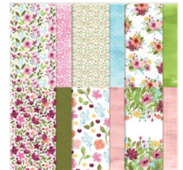
Awash In Beauty 12" X 12" (30.5 X 30.5 Cm) Designer Series Paper - 158973