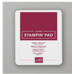
Merry Merlot Classic Stampin' Pad - 147112