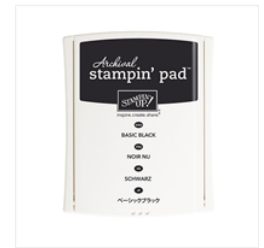
Basic Black Archival Stampin' Pad - 140931