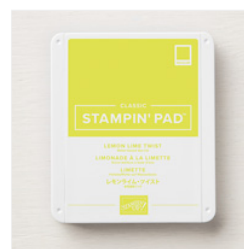
Lemon Lime Twist Classic Stampin' Pad - 147145