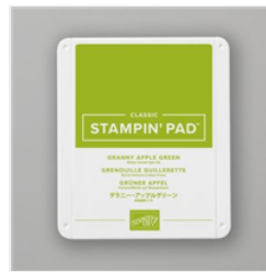
Granny Apple Green Classic Stampin' Pad - 147095