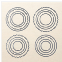
Layering Circles Dies - 141705