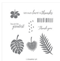
Tropical Chic Clear-Mount Stamp Set - 146753