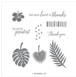
Tropical Chic Clear-Mount Stamp Set - 146753