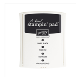
Basic Black Archival Stampin' Pad - 140931