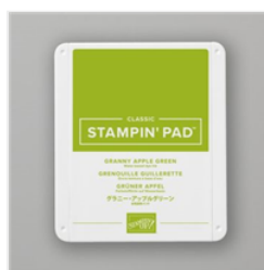
Granny Apple Green Classic Stampin' Pad - 147095