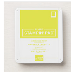
Lemon Lime Twist Classic Stampin' Pad - 147145