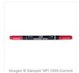
Real Red Stampin' Write Marker - 100052