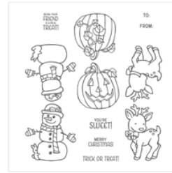
Seasonal Chums Wood-Mount Stamp Set - 144945