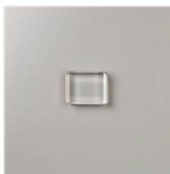
Clear Block B - 117147