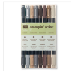
Neutrals Stampin' Write Markers - 131261