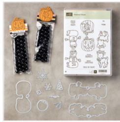
Seasonal Chums Wood-Mount Bundle* - 146076