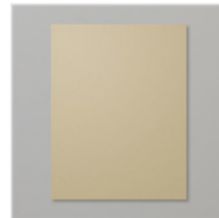
Crumb Cake 8-1/2" X 11" Cardstock - 120953