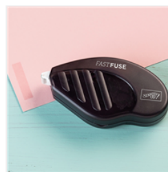
Fast Fuse Adhesive - 129026