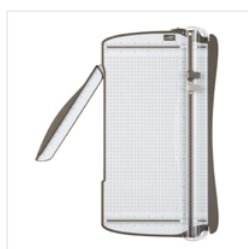
Stampin' Trimmer - 126889