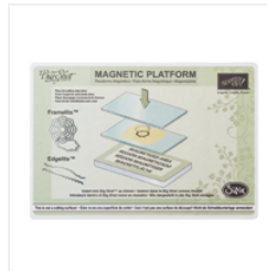
Magnetic Platform - 130658