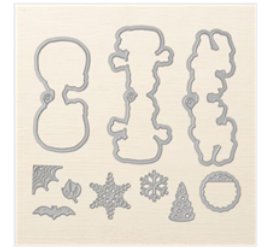
Seasonal Tags Framelits Dies - 144685