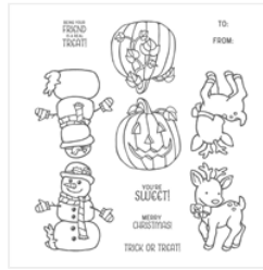
Seasonal Chums Clear-Mount Stamp Set - 144948