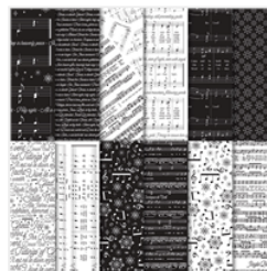
Merry Music Specialty Designer Series Paper - 144623