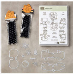
Seasonal Chums Clear-Mount Bundle* - 146077