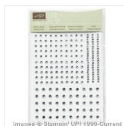
Rhinestone Basic Jewels - 119246