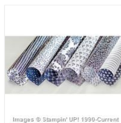
Floral Boutique Designer Series Paper - 141663