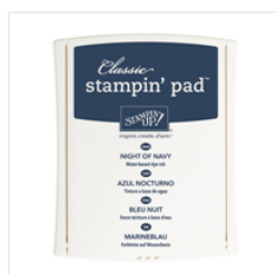
Night Of Navy Classic Stampin' Pad - 126970