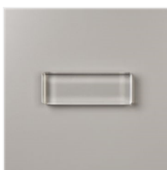
Clear Block H - 118490