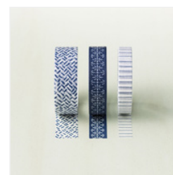
Floral Boutique Designer Washi Tape - 141664