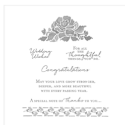
Floral Phrases Wood-Mount Stamp Set - 141764

Angela McFarlane +61 0413 438 026 amac@angelamcfarlane.com www.angelamcfarlane.com