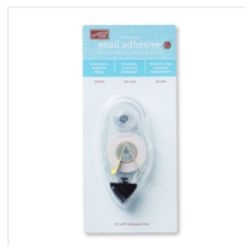
Snail Adhesive Refill - 104331