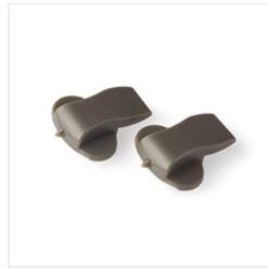
Stampin' Trimmer Cutting Blades - 126995