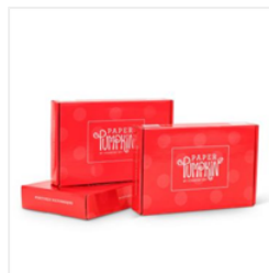
Prepaid Paper Pumpkin Subscription 3- Month - 137859