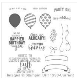
Balloon Adventures Photopolymer Stamp Set - 142823