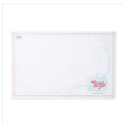
Paper Pumpkin Grid Paper - 143578