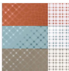
Tartan Foil 12" X 12" (30.5 X 30.5 Cm) Specialty Designer Series Paper - 162332