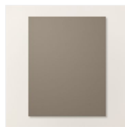
Pebbled Path 8-1/2" X 11" Cardstock - 161722