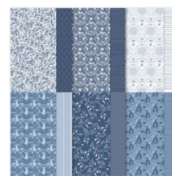
Countryside Inn 12" X 12" (30.5 X 30.5 Cm) Designer Series Paper - 161467