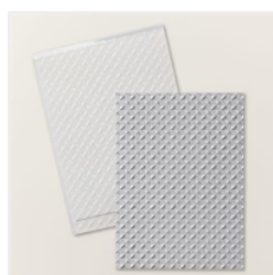
Metal Plate 3D Embossing Folder - 160766