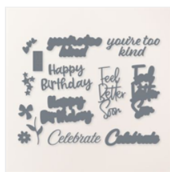
Wanted To Say Dies - 161594

stampwithtammy@gmail.com http://tammyfite.stampinup.net