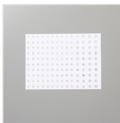
Rhinestone Basic Jewels - 144220