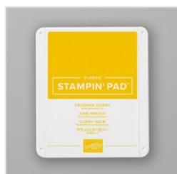
Crushed Curry Classic Stampin' Pad - 147087