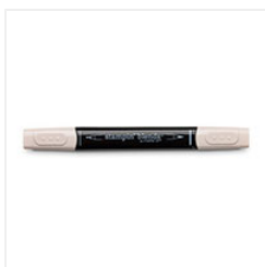
Ivory Stampin' Blends Marker - 144606