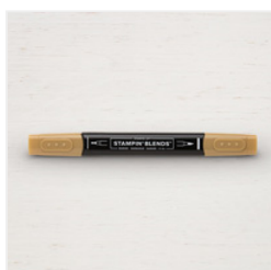
Soft Suede Light Stampin' Blends Marker - 146874