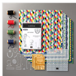
Country Club Suite Bundle - 153930

creativestampingwithMargaret@gmail.com www.CreativeStampingwithMargaret.com