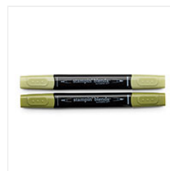
Old Olive Stampin' Blends Markers Combo Pack - 144597