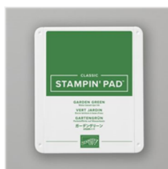
Garden Green Classic Stampin' Pad - 147089