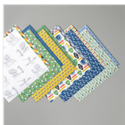
Country Club Designer Series Paper - 151314