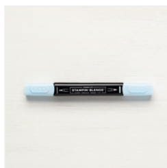
Balmy Blue Light Stampin' Blends Marker - 148540