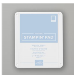
Seaside Spray Classic Stampin' Pad - 150085