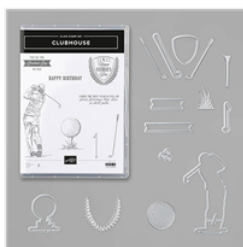
Clubhouse Bundle - 153816