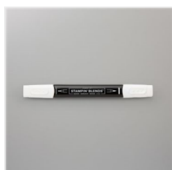
Stampin' Blends Color Lifter - 144608