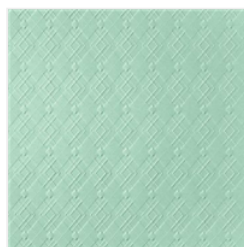
Absolutely Argyle 3D Embossing Folder - 151590