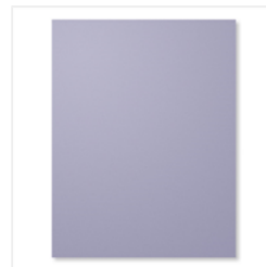
Wisteria Wonder 8-1/2 X 11 Cardstock - 122922