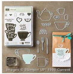
A Nice Cuppa Photopolymer Bundle - 141074