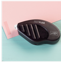
Fast Fuse Adhesive - 129026