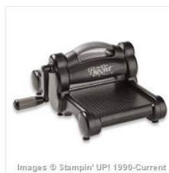
Big Shot - 113439