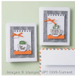
Thanks A Latte Kit - 140782

stampwithmarybush@yahoo.com www.stampinthesand.stampinup.net