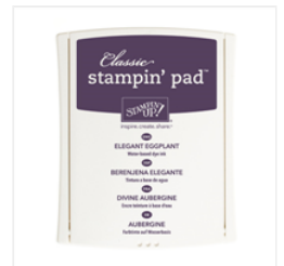
Elegant Eggplant Classic Stampin' Pad - 126969