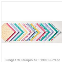
Have A Cuppa Designer Series Paper Stack - 140567