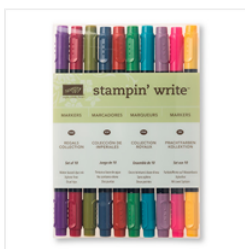
Regals Stampin' Write Markers - 131262