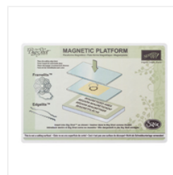
Magnetic Platform - 130658