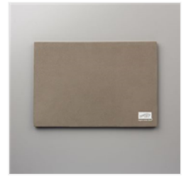
Stampin' Pierce Mat - 126199