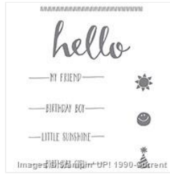
Hello Wood-Mount Stamp Set - 141240