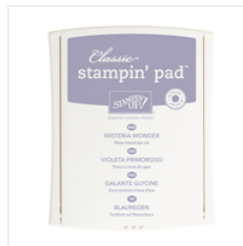
Wisteria Wonder Classic Stampin' Pad - 126985