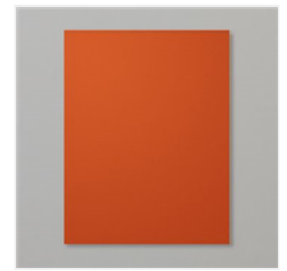
Cajun Craze 8-1/2" X 11" Cardstock - 119684