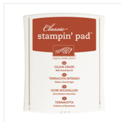
Cajun Craze Classic Stampin' Pad - 126965