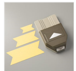
Triple Banner Punch - 138292