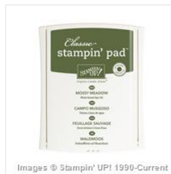
Mossy Meadow Classic Stampin' Pad - 133645