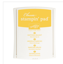
Daffodil Delight Classic Stampin' Pad - 126944