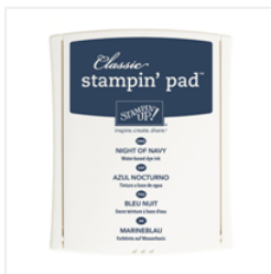
Night Of Navy Classic Stampin' Pad - 126970