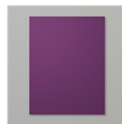
Blackberry Bliss 8-1/2" X 11" Cardstock - 133675