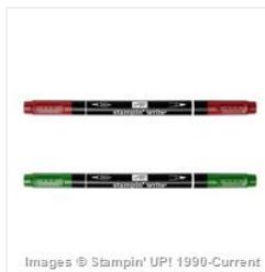
Cherry Cobbler & Garden Green Stampin' Write Markers - 141972