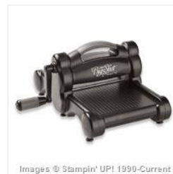
Big Shot - 113439