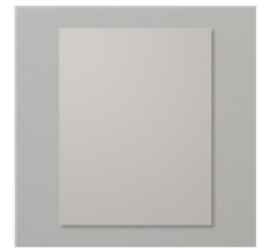
Gray Granite 8-1/2" X 11" Cardstock - 146983