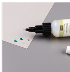
Fine-Tip Glue Pen - 138309