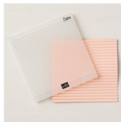
Corrugated Dynamic Textured Impressions Embossing Folder - 148026