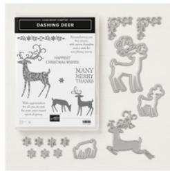
Dashing Deer Clear-Mount Bundle - 149935