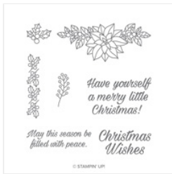
Stamp Set Clear Peaceful Poinsettia - 147781

http://creativemeasuresbytiffany.blogspot.com/