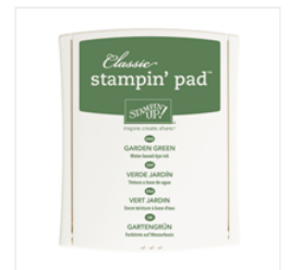
Garden Green Classic Stampin' Pad - 126973