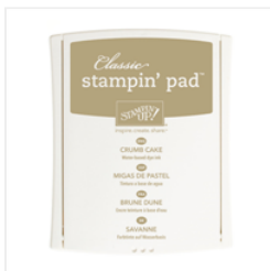
Crumb Cake Classic Stampin' Pad - 126975