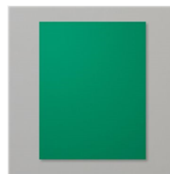
Shaded Spruce 8-1/2" X 11" Cardstock - 146981