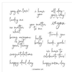
Happy & Heartfelt Cling Stamp Set (English) - 158005