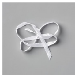
Whisper White 1/4" (6.4 Mm) Crinkled Seam Binding Ribbon - 151326