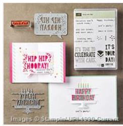
Party With Cake Clear-Mount Bundle - 140814 Price: $42.50