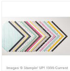
It's My Party Designer Series Paper Stack - 140552 Price: $26.00