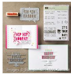
Party With Cake Wood-Mount Bundle - 140815 Price: $49.25