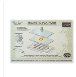
Magnetic Platform - 130658 Price: $40.00