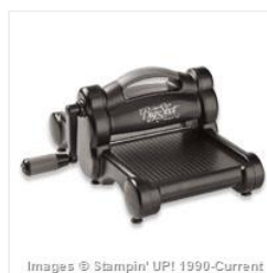
Big Shot - 113439 Price: $110.00