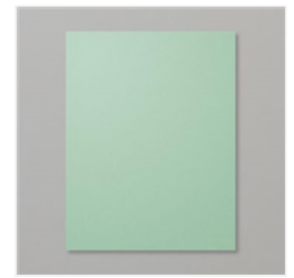
Mint Macaron 8- 1/2" X 11" Cardstock - 138337 Price: $9.25