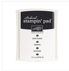
Basic Black Archival Stampin' Pad - 140931 Price: $7.00