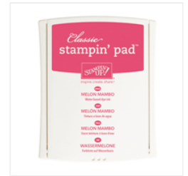
Melon Mambo Classic Stampin' Pad - 126948 Price: $6.50