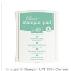
Mint Macaron Classic Stampin' Pad - 138326 Price: $6.50