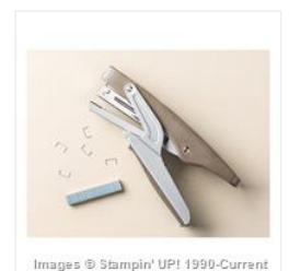
Handheld Stapler - 139083 Price: $10.00