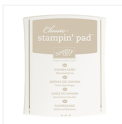
Sahara Sand Classic Stampin' Pad - 126976 Price: $6.50