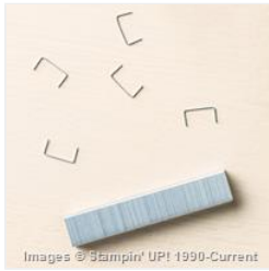
Silver Mini Staples - 135847