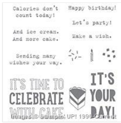
Party With Cake Clear-Mount Stamp Set - 140672 Price: $20.00