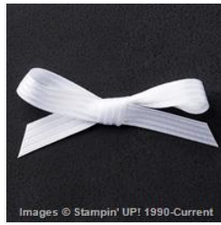
Whisper White 3/8" Stitched Satin Ribbon - 138429