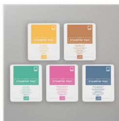
Cl Stmpn Pad In Color 20-22 - 154957