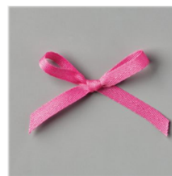
Magenta Madness 2020-2022 In Color Ribbon - 153623