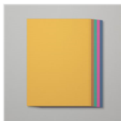
2020-2022 In Color™ 8-1/2" X 11" Cardstock - 153074