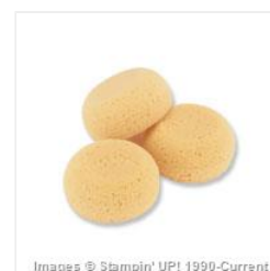
Stamping Sponges - 101610