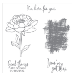
You've Got This Clear-Mount Stamp Set - 139575

http://creativemeasuresbytiffany.blogspot.com/