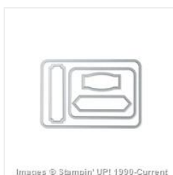
Project Life Cards & Labels Framelits Dies - 135707