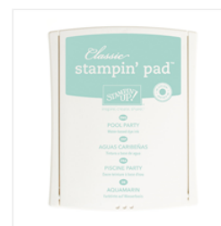
Pool Party Classic Stampin' Pad - 126982