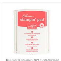
Watermelon Wonder Classic Stampin' Pad - 138323