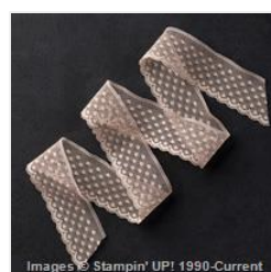
Tip Top Taupe 1" Dotted Lace Trim - 138422