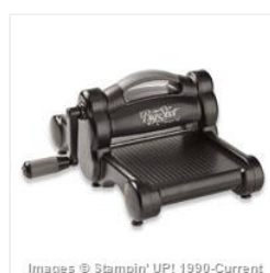
Big Shot - 113439