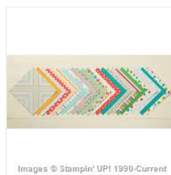
Cherry On Top Designer Series Paper Stack - 138443