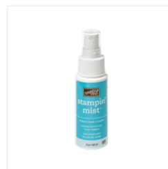
Stampin' Mist - 102394