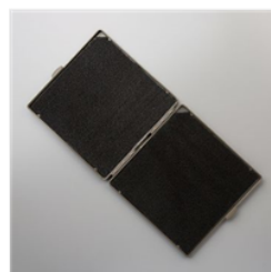
Stampin' Scrub - 126200