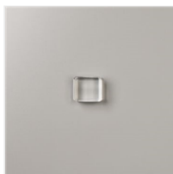
Clear Block A - 118487