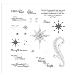
Star Of Light Photopolymer Stamp Set - 142110