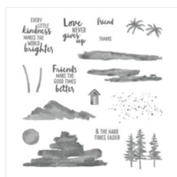
Waterfront Photopolymer Stamp Set (En) - 146386