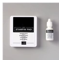
Unlinked Stampin' Pad & Whisper White Refill - 147277