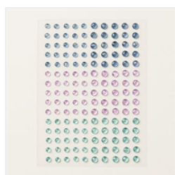
Tinsel Gems Three-Pack - 161624