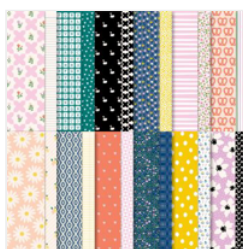
Delightfully Eclectic 12" X 12" (30.5 X 30.5 Cm) Designer Series Paper - 161640