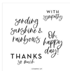
Kindest Expressions Cling Stamp Set (English) - 161415

thesweetinker@gmail.com www.soinkingsweet.com