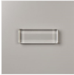
Clear Block H - 118490