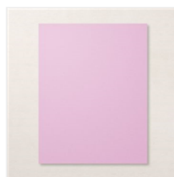
Fresh Freesia 8-1/2" X 11" Cardstock - 155613