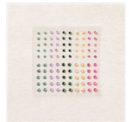
2021-2023 In Color Jewels - 155571