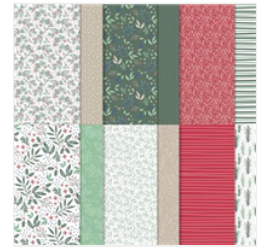
Tidings Of Christmas 6" X 6" (15.2 X 15.2 Cm) Designer Series Paper - 155718