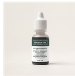
Evening Evergreen Classic Stampin' Ink Refill - 155577