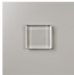
Clear Block D - 118485