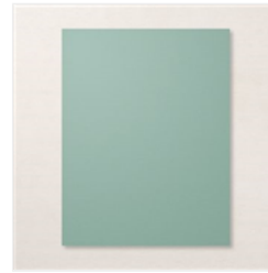
Soft Succulent 8-1/2" X 11" Cardstock - 155776