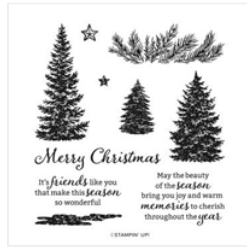
Evergreen Elegance Stamp Set - 153313