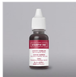
Cherry Cobbler Classic Stampin' Ink Refill - 119788