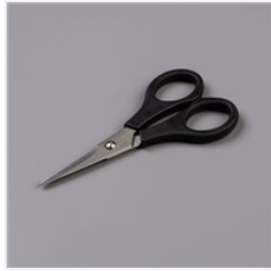
Paper Snips Scissors - 103579