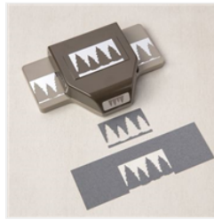
Evergreen Border Punch - 153603