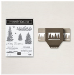
Evergreen Elegance Bundle (English) - 155579