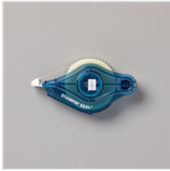
Stampin' Seal+ Refill - 152812

Anne Granger 519-268-1540 agranger21@outlook.com www.stampwithanne.com