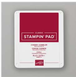
Cherry Cobbler Classic Stampin' Pad - 147083