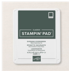
Evening Evergreen Classic Stampin' Pad - 155576