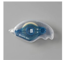
Stampin' Seal+ - 149699