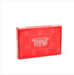
Prepaid Paper Pumpkin Subscription 1- Month - 137858 Price: $24.00