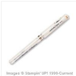
White Signo Uni- Ball Gel Pen - 105021 Price: $4.00